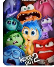
Inside Out 2